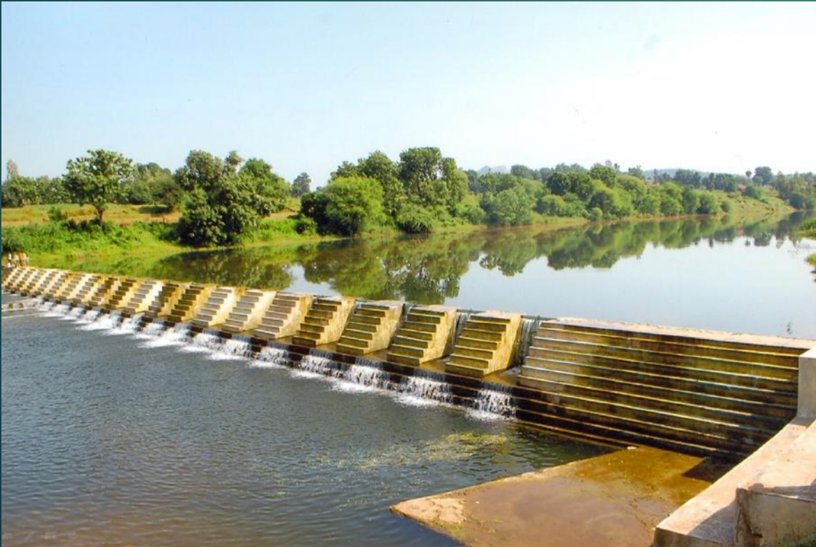
GHADA CHECK DAM Gates Over river Panama in Dahod District, Gujarat